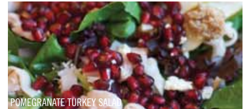
POMEGRANATE TURKEY SALAD

CHICKPEA SALAD NEW Fresh mix of romaine and iceberg lettuce topped with chickpeas, tomato, red cabbage, cucumbers, red onions, feta cheese, walnuts with house vinaigrette dressing 8.99