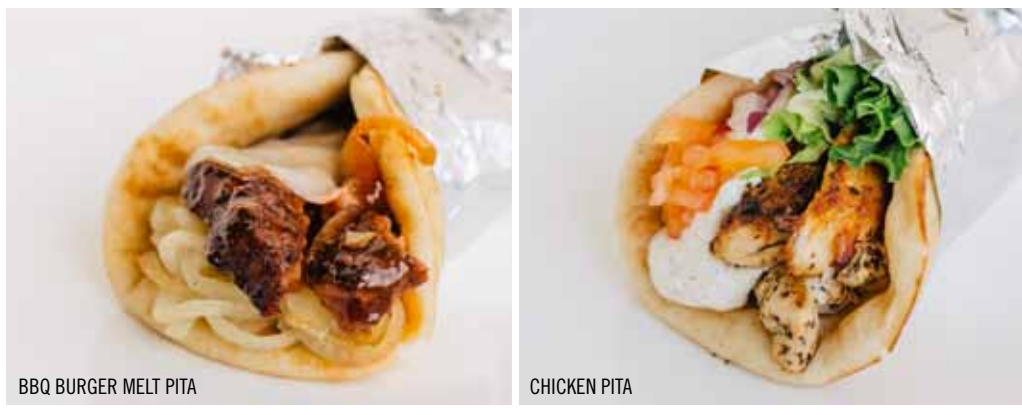
BBQ BURGER MELT PITA