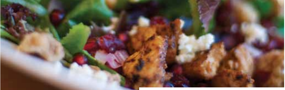
MIXED GREENS SALAD WITH GRILLED CHICKEN