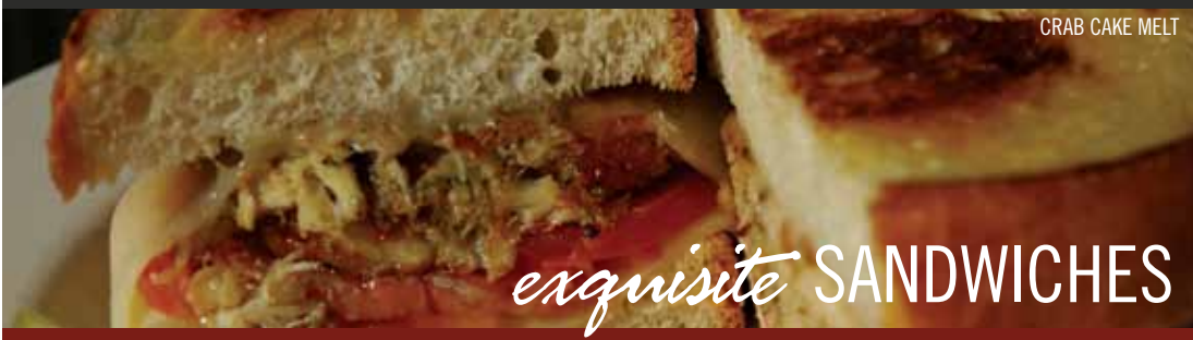
CRAB CAKE MELT