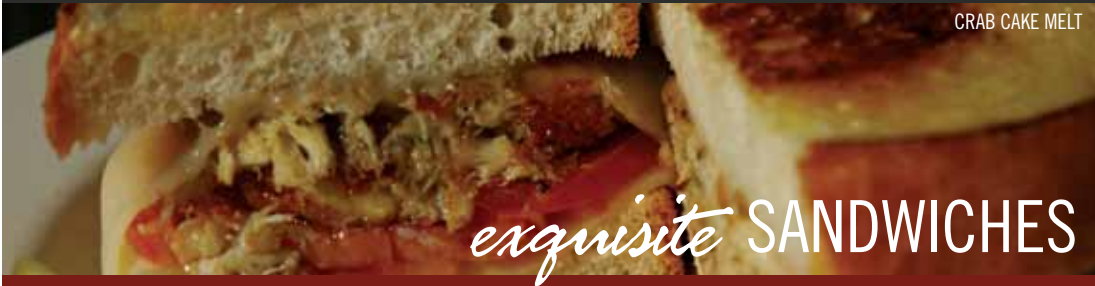
CRAB CAKE MELT