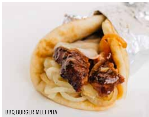
BBQ BURGER MELT PITA