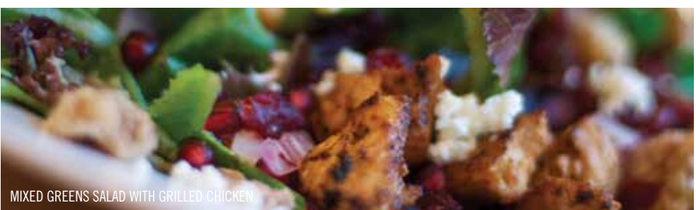
MIXED GREENS SALAD WITH GRILLED CHICKEN