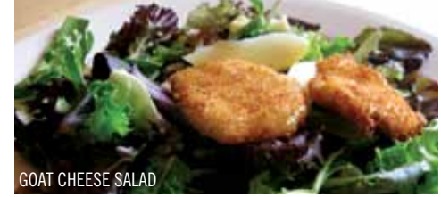
GOAT CHEESE SALAD