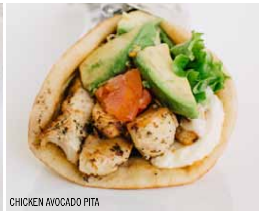
CHICKEN AVOCADO PITA