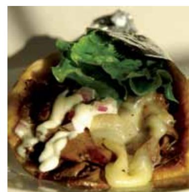
ROAST BEEF PITA