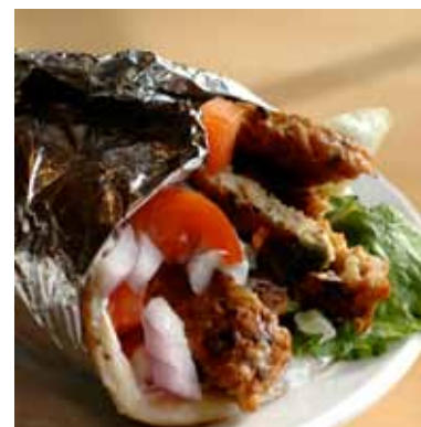
VEGGIE BURGER PITA