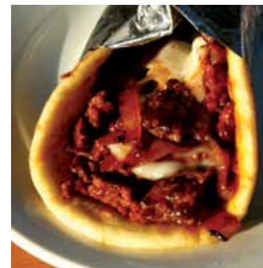
BBQ BURGER MELT PITA