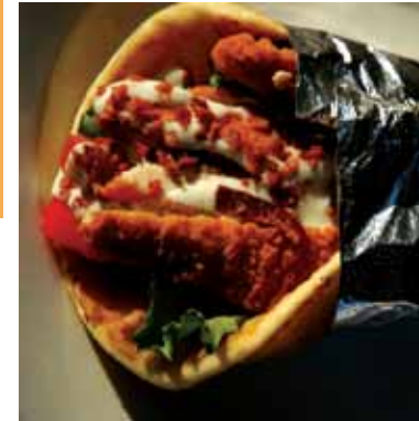
CHICKEN TENDER PITA

FISH & CHIPS with french fries & cole slaw 7.99 HAMBURGER STEAK with grilled onions, french fries & cole slaw 8.99 HOT ROAST BEEF with french fries & cole slaw 8.99 SHRIMP IN THE BASKET (beer battered) with french fries & cole slaw 9.99 FRIED JUMBO SHRIMP with french fries & cole slaw 9.99 LUMP CRAB CAKES (homemade) with french fries & cole slaw 17.99 10 WINGS with french fries 8.99 TENDERS (honey mustard or BBQ sauce) with french fries 7.99 11oz BEER BATTERED HADDOCK with french fries and cole slaw 12.99 CHICKEN PITA PLATTER with french fries 8.99 open faced chicken pita (as above) with feta, olives, and banana peppers